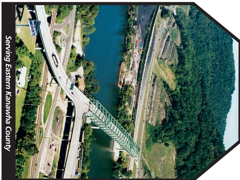
Serving Eastern Kanawha County