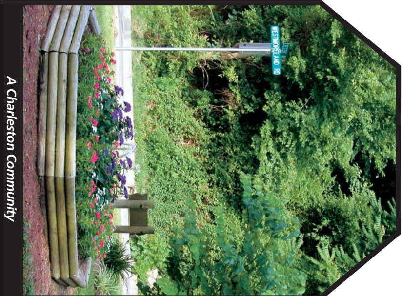
A Charleston Community

Downtown Charleston • CAMC Women & Children's Hospital Westmoreland Playground Garrison Avenue Edgewood Acres Center